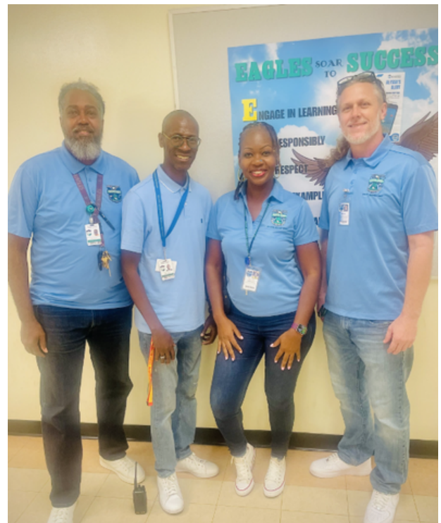
Behavior Specialist Quadruplets