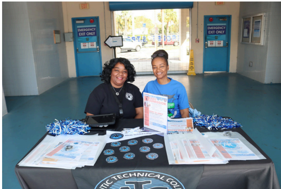
Atlantic Technical College visit