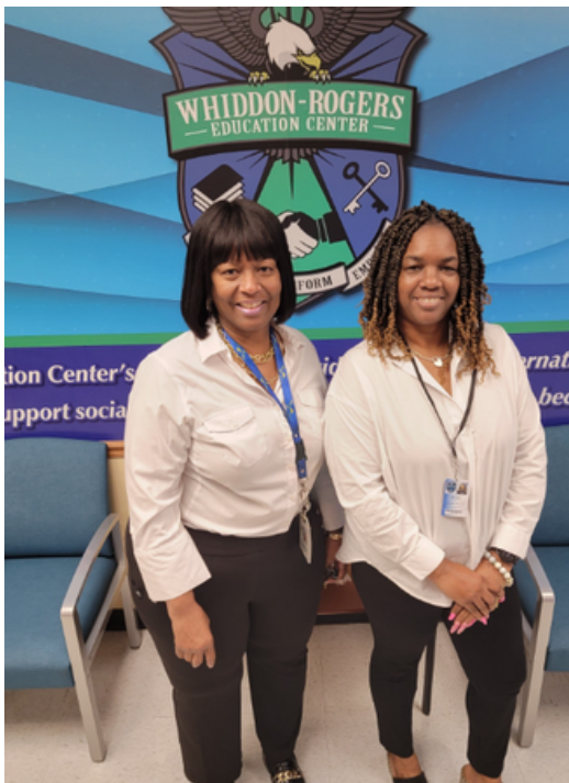
The Money Twins